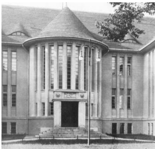
Administrative building, VEB NEPTUN

VEB NEPTUN WERFT was one of the successful state shipyards of the former GDR. With excellent and reliable constructions, modern ships could be exported all over the world.